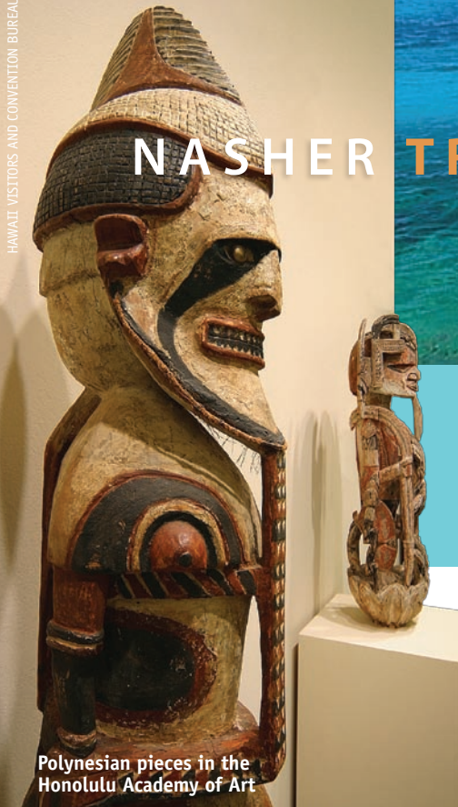
Polynesian pieces in the Honolulu Academy of Art

The Duke Alumni Association and the Nasher Museum of Art have collaborated to create a unique arts travel experience in Hawaii. You'll have a "behind-the-scenes" look into Hawaii's art and culture. Your kama'aina (local guide) will give you an insider perspective, introducing you to special places that have limited access and "must see" exhibits. There will be a private tour of Doris Duke's Shangri La estate, a chance to meet local artists, and visits to several private collections. Discover Hawaii in a program conceived and developed especially for the DAA and the Nasher.