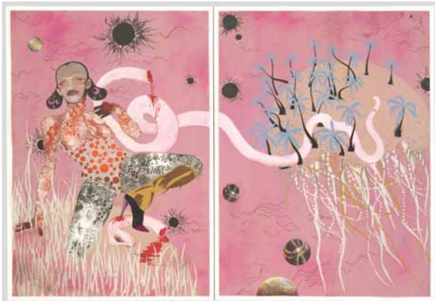
Wangechi Mutu Yo Mama , 2003 ink, mica flakes, pressure-sensitive synthetic polymer sheeting, cut-and-pasted printed paper, painted paper, and synthetic polymer paint on paper; overall: 59 1/8 x 85 in.

chasing and eating all she sees, Santigold's character eventually implodes under the weight of her own gravity. In a MOCATv interview featuring both artists, they assert that their collaboration is a reflection of consumption and excess.