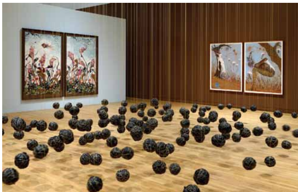
Wangechi Mutu Suspended Playtime , 2008/2013 packing blankets, twine, garbage bags, and gold string; dimensions variable

Alternative hip-hop star Santigold performs the role of a fantastical monster in Mutu's most recent video work. Floating in a polluted celestial space while