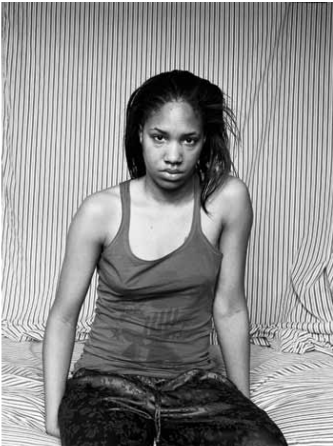
LaToya Ruby Frazier Self-Portrait (March 10 a.m.), 2009 gelatin silver photograph, 19½ x 15 in.

sites, including the local hospital over the course of its final years. An example of the intersection between public and private experience has Frazier (in mirror-view) and her mother inside a tavern that clings to life in the shadow of the neighboring hospital's ruins.