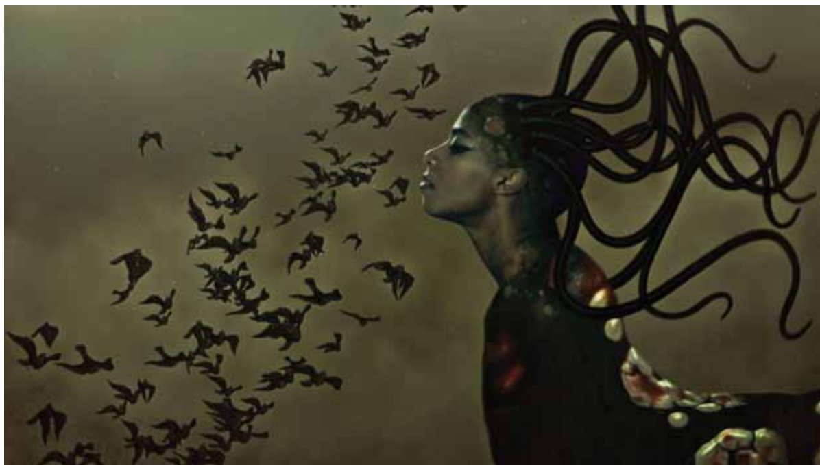
Wangechi Mutu, The End of Eating Everything (still), 2013 animated video (color, sound), eight-minute loop, edition of six

heel of her boot. Floating on a grassy planet, she crouches amidst black stars and celestial bodies that are described as symbols of the African Diaspora. These spheres are echoed in Suspended Play Time , 2008/2013, an installation of balls made of black plastic suspended by twine and bound in gold string. These balls echo both Mutu's imagined worlds and the improvised toys made throughout the world by children who cannot afford soccer balls.