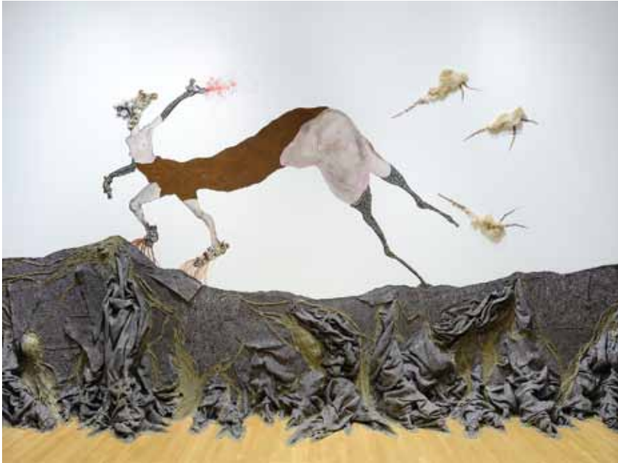
Wangechi Mutu Once Upon a Time She Said, I'm Not Afraid and Her Enemies Became Afraid of Her the End , 2013 mixed media, dimensions variable