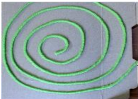
GLUE THE STRING

You can create your own printing plate by glueing string or yarn to cardboard! First, use a pencil to create a simple design or to draw a simplified picture – something that is made up of lines. Next, using normal white school glue go over the lines of your design with a thin line of glue. Next, press the string or yarn into the glue and allow to dry. Once your printing plate is dry, you can then use a brush or your fingers to add paint to your plate. Once you've covered all of the string with paint (don't worry about it getting elsewhere on the paper), you can put a clean sheet of paper on top of your print and carefully press down. Make sure to press all around the image so all of your design transfers. Carefully peel up the piece of paper and admire your print! The best thing about printmaking is now you can repeat this process over and over – making as many prints as you want!