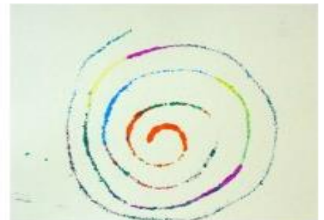
PRINT THE STRING!