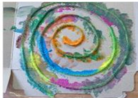
PAINT THE STRING